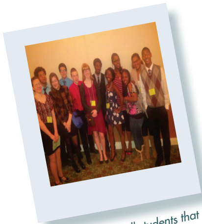
Group photo of all students that participated in the MI-CAPP.