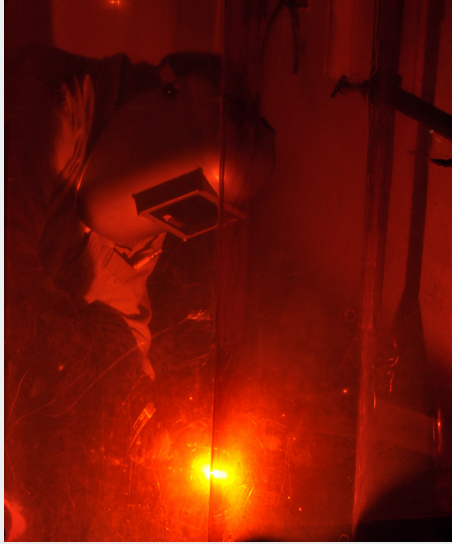
Welding demonstration.

The Industrial Technology Division held X-TECH, its annual open house event, on October 29. The event provided nearly 150 high school students, parents and adults seeking career changes with the opportunity to try their hand at numerous technology demonstrations, including computer-aided design, welding, manufacturing, automation, robotics, metrology, materials engineering and construction. Participants from industry included DTE Energy and Hexagon Metrology.