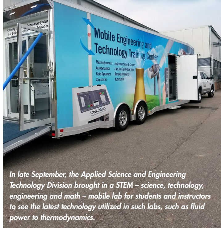
In late September, the Applied Science and Engineering Technology Division brought in a STEM – science, technology, engineering and math – mobile lab for students and instructors to see the latest technology utilized in such labs, such as fluid power to thermodynamics.